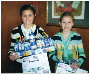
Children of the Jewish Learning Center